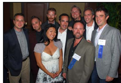
Sony/ Screen Gems— Takers Receives Location Team of the Year for Features

This year's Diamond Level sponsors included: Daily Variety, L.A. Marriott Downtown, Contigo Visual, Morongo Casino Resort & Spa, The Showpros and Teamsters Local 399.